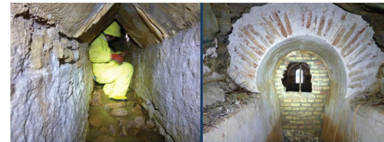
Utilization of the Hadrian Aqueduct

5.5 Integrated intervention for the promotion and utilization of the Hadrian Aqueduct