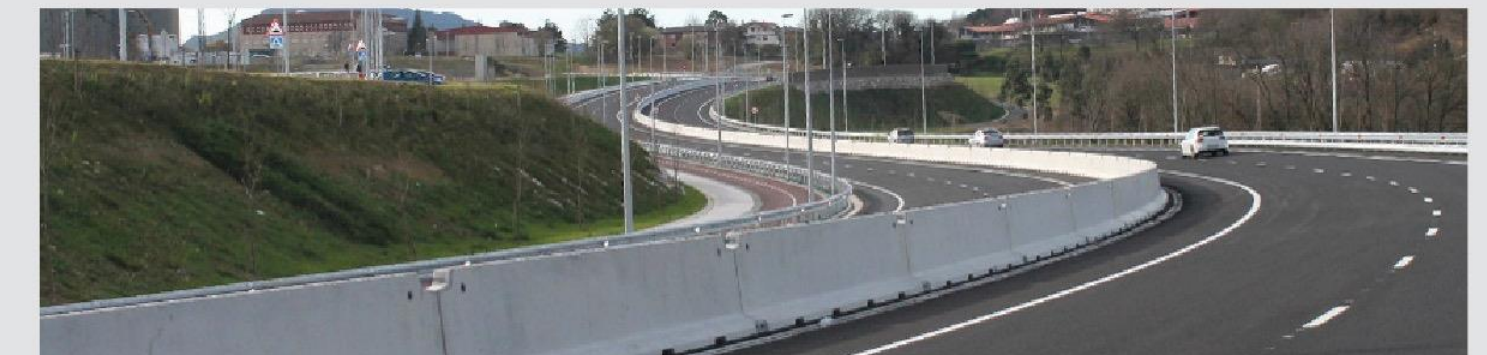
Implementation of road construction projects