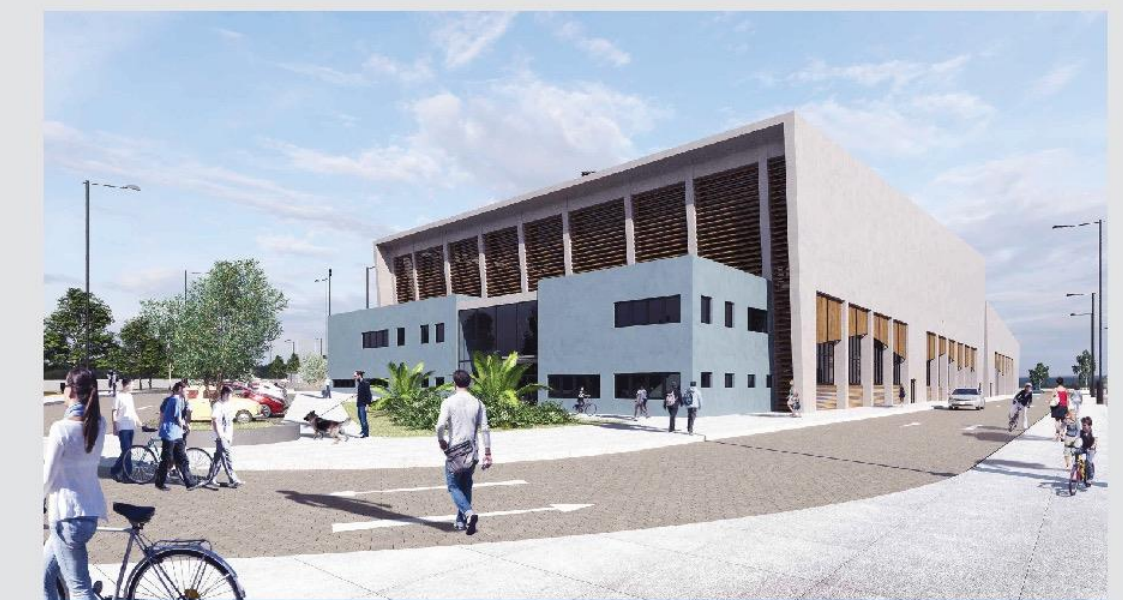
Paralympic Sports Center of Rafina